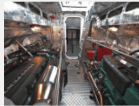
Seaward Nelson 42 Pilot Boat Engine Room