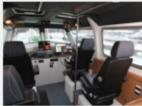
Seaward Nelson 42 Pilot Boat Wheelhouse