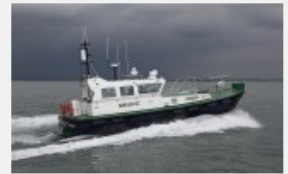
Seaward Nelson 42 Pilot Boat, Fredericia, Denmark.