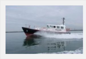
Seaward Nelson 42 Pilot Boat, Tenerife, Spain.