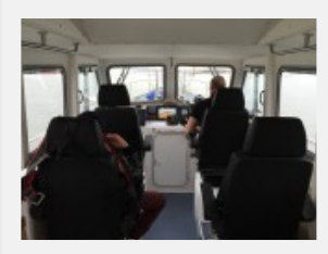
Seaward Nelson 40 Pilot Boat Wheelhouse