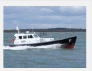
Seaward Nelson 40 Pilot Boat, Genoa, Italy