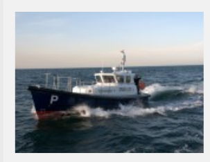
Seaward Nelson 40 Pilot Boat, La Coruna, Spain