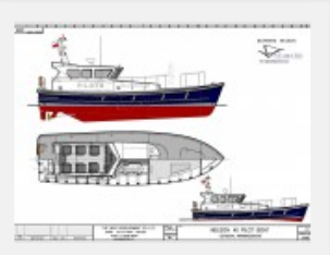
Seaward Nelson 40 Pilot Boat